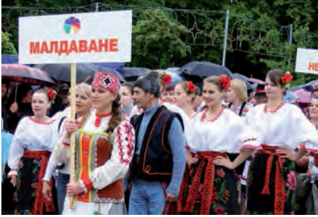
Republican Festival of National Cultures, Hrodna, Belarus