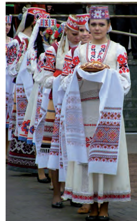
Republican Festival of National Cultures, Hrodna, Belarus