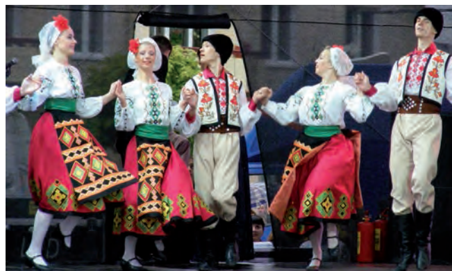
Republican Festival of National Cultures, Hrodna, Belarus